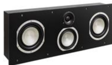
Platinum IW-100 LRCS