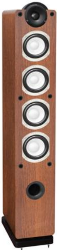
Platinum F-60 SL