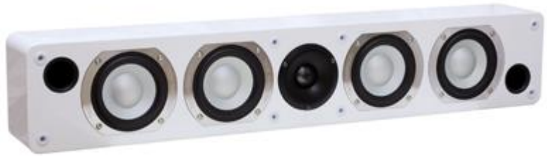
Platinum LCR-60 SL

Floorstanding models: The height excluding spikes and including a base. The weight including a base.