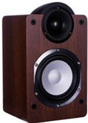
Platinum S-90 SL