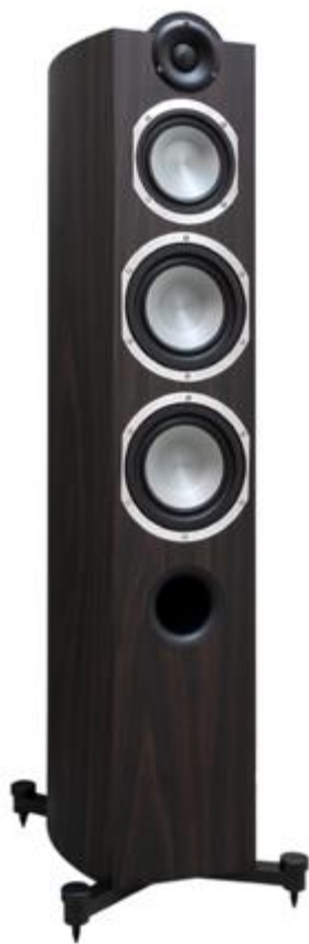
Platinum F-100 v.3