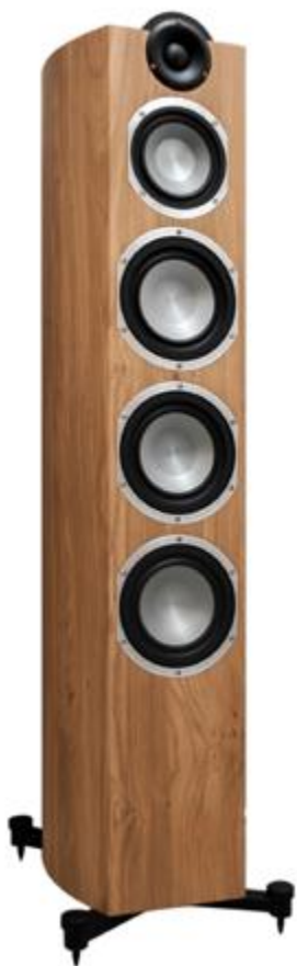
Platinum F-120 v.3

The dimensions and weights: Floorstanding models: including the grill, feet and spikes. Other models: including the grill.