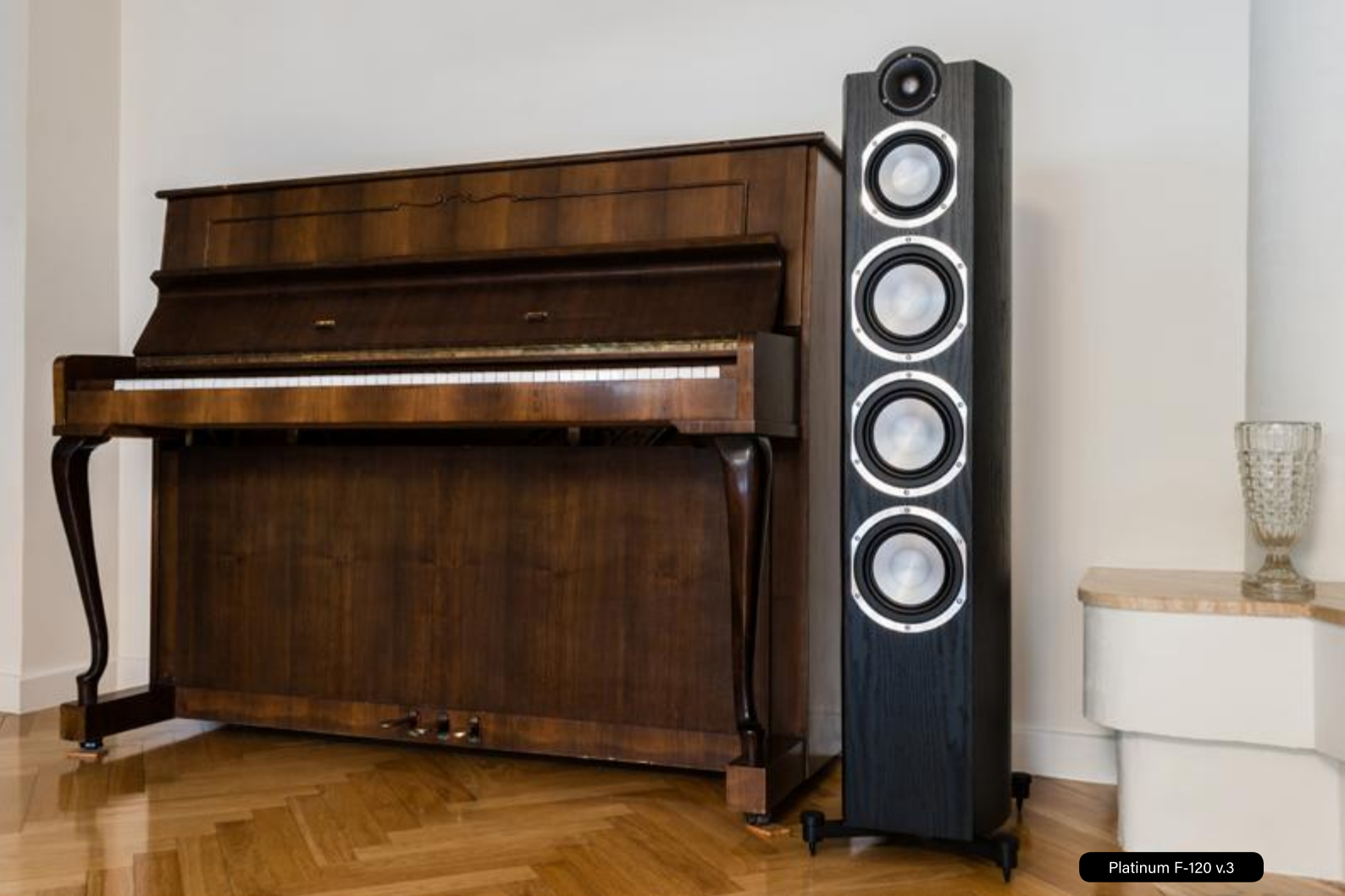
Platinum F-120 v.3