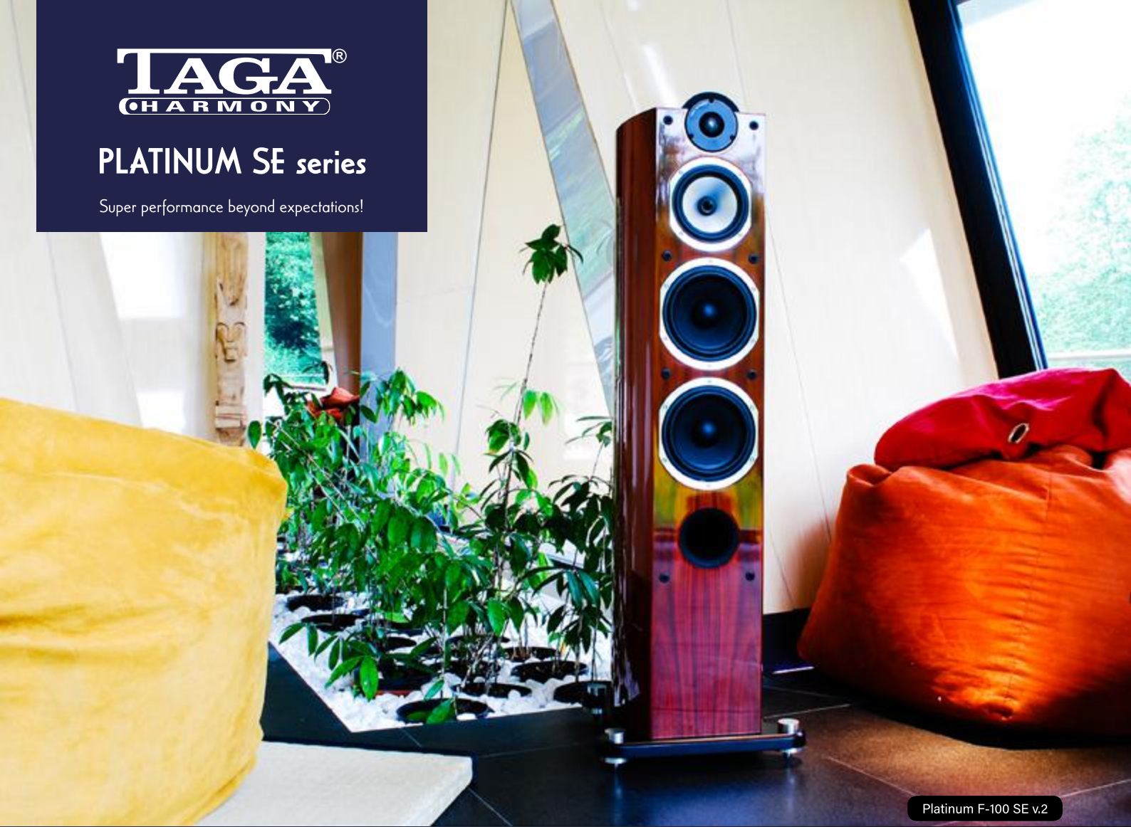
Platinum F-100 SE v.2

The award-winning and highly acclaimed Platinum v.2 series is the progenitor of our flagship Special Edition SE series. But the similarities between the SE series and the Platinum series are only the shapes of the enclosures. The High class finishes, all components and technology are totally new or deeply revised.