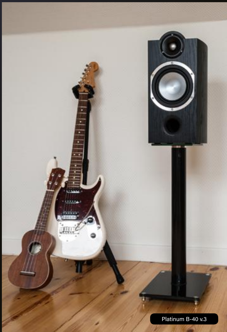
Platinum B-40 v.3

2017-2018 AV TOP 100! Best Buy Award 优秀器材推荐榜