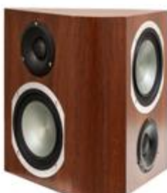
Platinum S-100 v.3