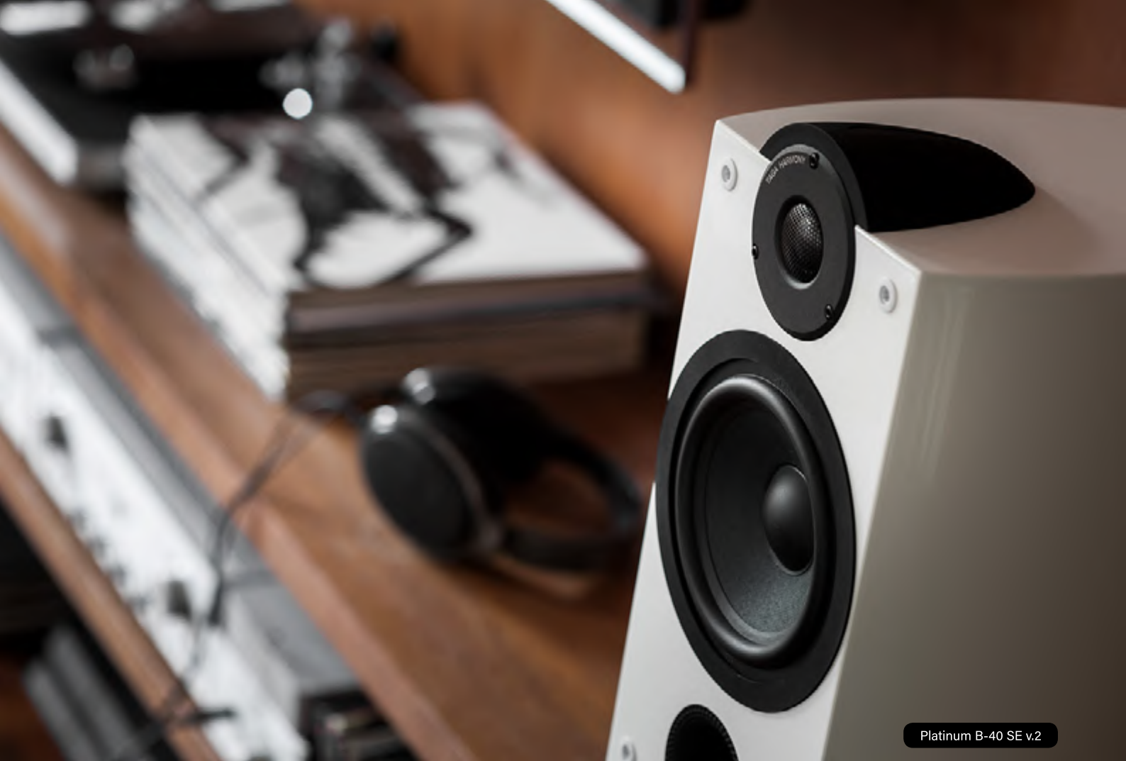
Platinum B-40 SE v.2