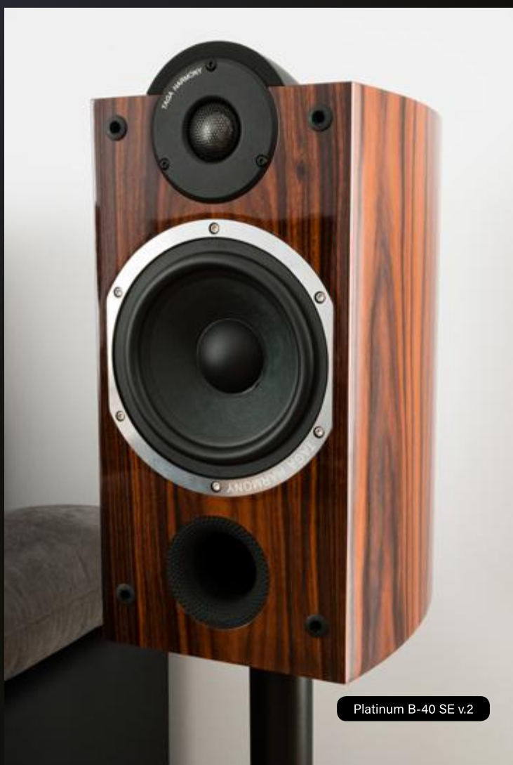
Platinum B-40 SE v.2