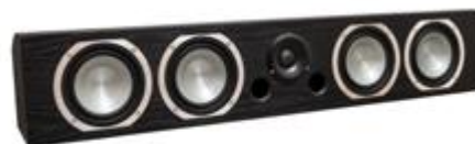
Platinum C-100 v.3