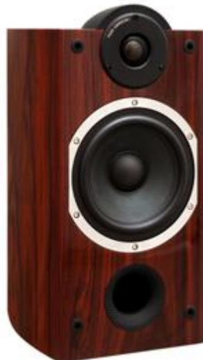
Platinum B-40 SE v.2