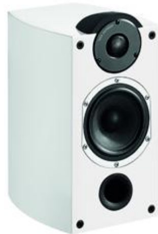
Platinum S-40 SE