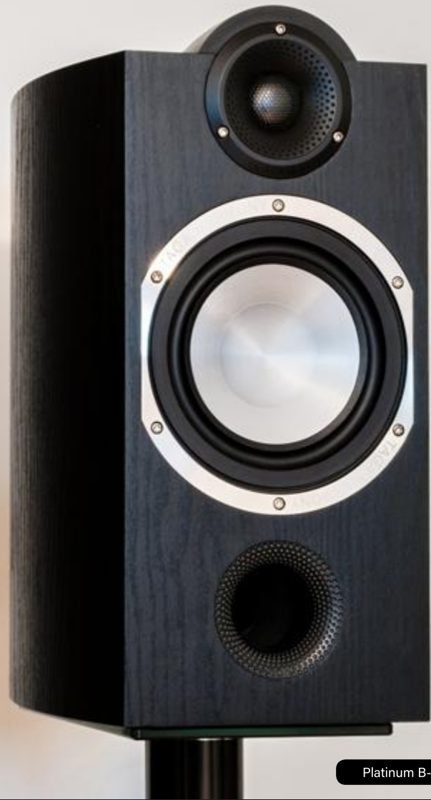
Platinum B-40 v.3

„Born in Europe - Crafted for the World” slogan is a very serious commitment and we treat it that way. That is why all of us at TAGA Harmony were engaged in creating this series - we focused mostly on intensive listening tests and sound adjustments rather than on creating perfect specifications on paper because music and generally sound is about feelings and passion.