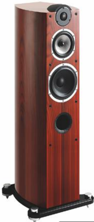
Platinum F-100 SE

Floorstanding models: The height excluding spikes and including a base. The weight including a base.