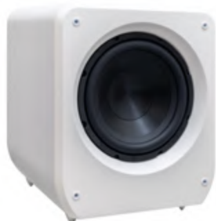
Platinum SW-10 v.3