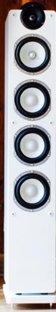
Platinum F-90 SL

You love the excellent sound of our award-winning and highly acclaimed Platinum series but your spouse would be furious seeing big boxes in your living room. Here comes the solution! The solution means no substitutions or compromises were used but just like in an old good movie: the Platinum series has just been shrunk to more compact, appealing SLIM version.