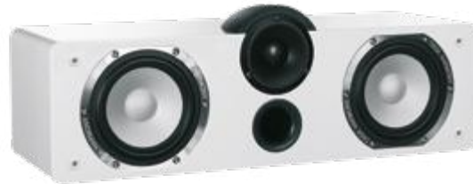
Platinum C-90 SL