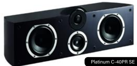
Platinum C-40PR SE