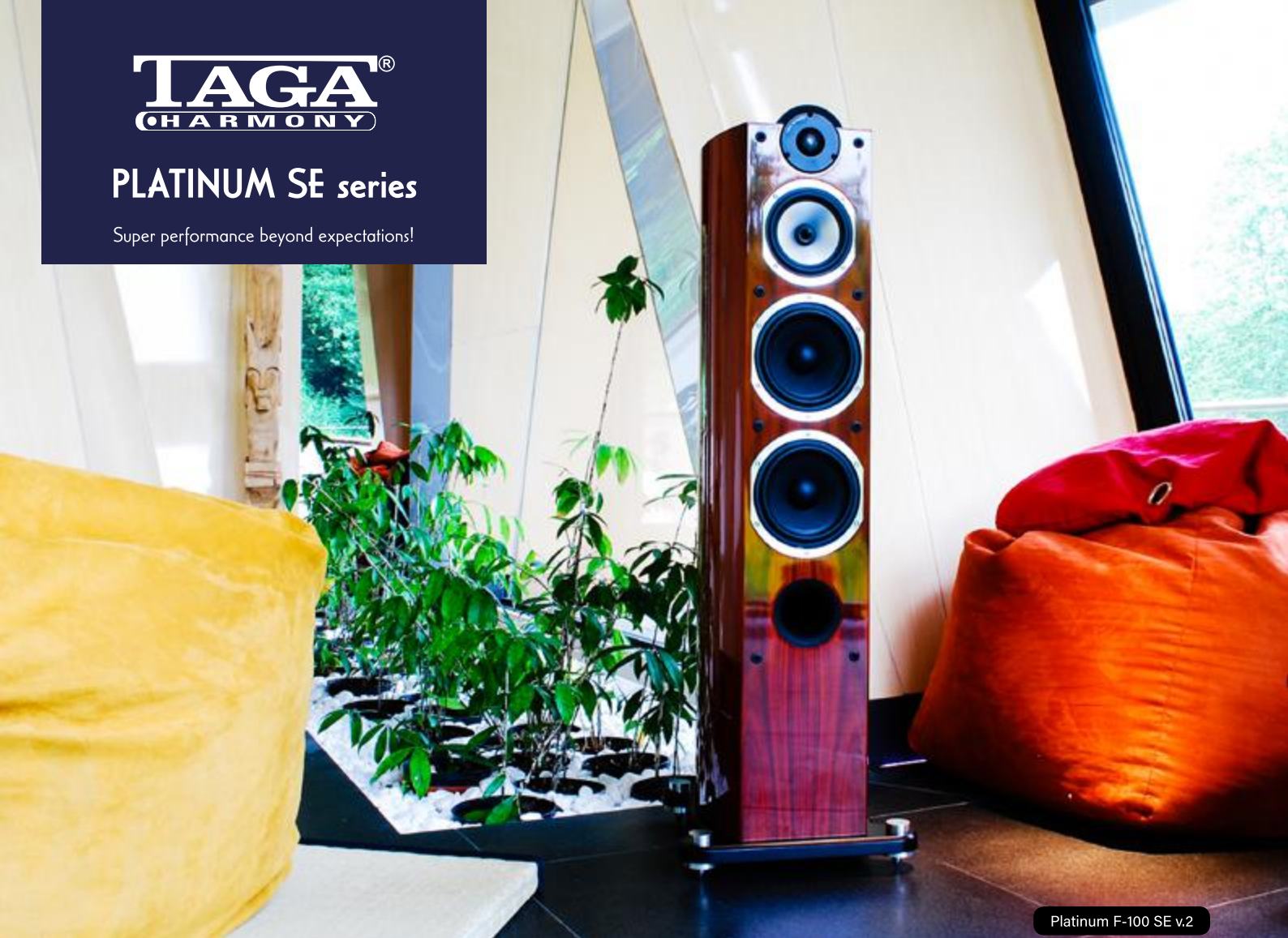
Platinum F-100 SE v.2

The award-winning and highly acclaimed Platinum v.2 series is the progenitor of our flagship Special Edition SE series. But the similarities between the SE series and the Platinum series are only the shapes of the enclosures. The High class finishes, all components and technology are totally new or deeply revised.