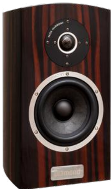
Diamond B-60 v.2