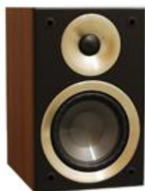
Azure S-40 v.2