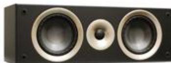
Azure C-40 v.2