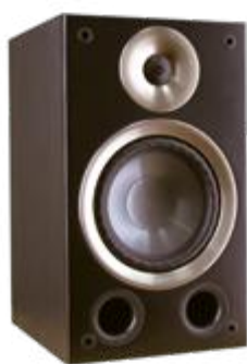
Azure B-40 v.2