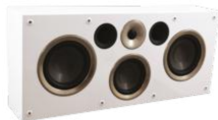
Azure OW-80 LCRS